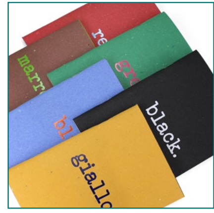
Small copy-books measuring 12x17 cm also form part of this collection

A special feature is the double-faced cover, showing the name of the colour in both Italian and English.